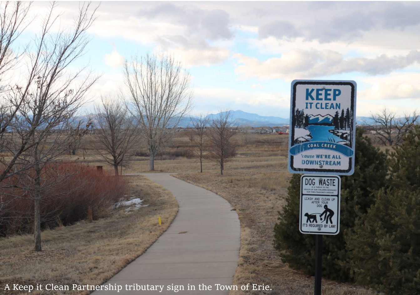
A Keep it Clean Partnership tributary sign in the Town of Erie.

After completing our new outreach strategy we will be starting a major redesign of our website with the goal of providing more accessible and easy to understand information about our watershed. We plan to be a go-to resource for reliable information about stormwater, water quality, and how to have a positive impact on your watershed. You can visit our website at www.keepitcleanpartnership.org for updates.