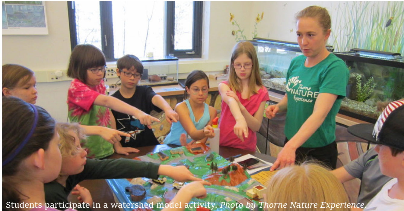
Students participate in a watershed model activity.

We coordinate watershed education and outreach efforts in the Boulder St. Vrain watershed. We work with local non-profits to provide field trips and classroom programs for young students, attend community events to engage with the public, and place advertisements in local publications.