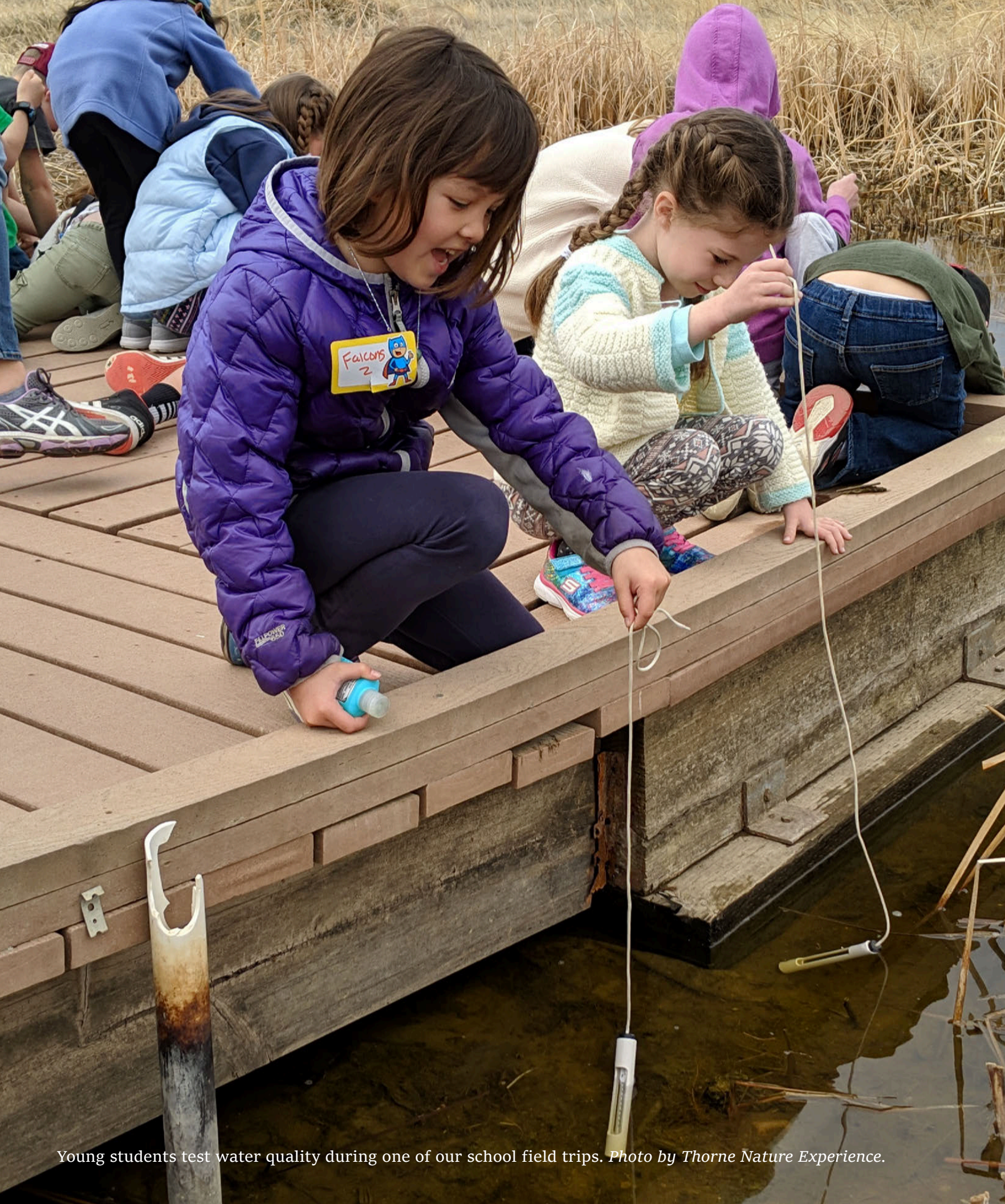
Young students test water quality during one of our school field trips.