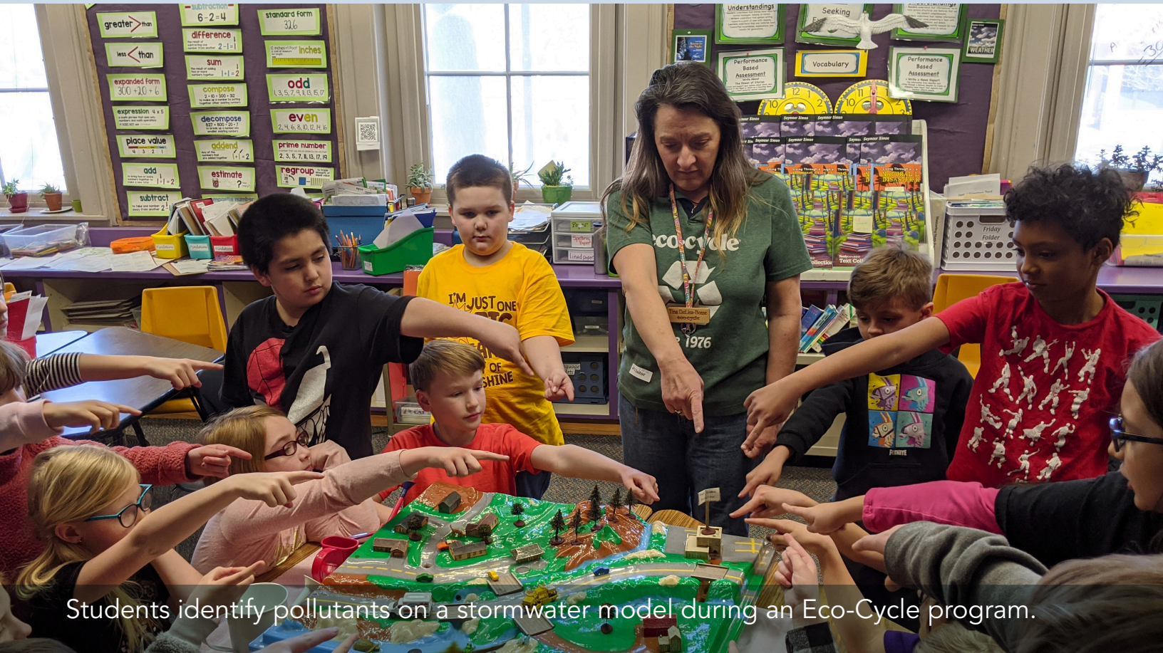
Students identify pollutants on a stormwater model during an Eco-Cycle program.

While we planned for the future of our Education and Outreach program, our community partners found creative ways to bring watershed learning into the homes of students. Thorne Nature Experience created and shared a virtual field trip with 300 classrooms and over 7,350 students. Eco-Cycle provided in-person classroom visits before moving to virtual presentations of their stormwater program and reached 42 classrooms, a total of 924 students.