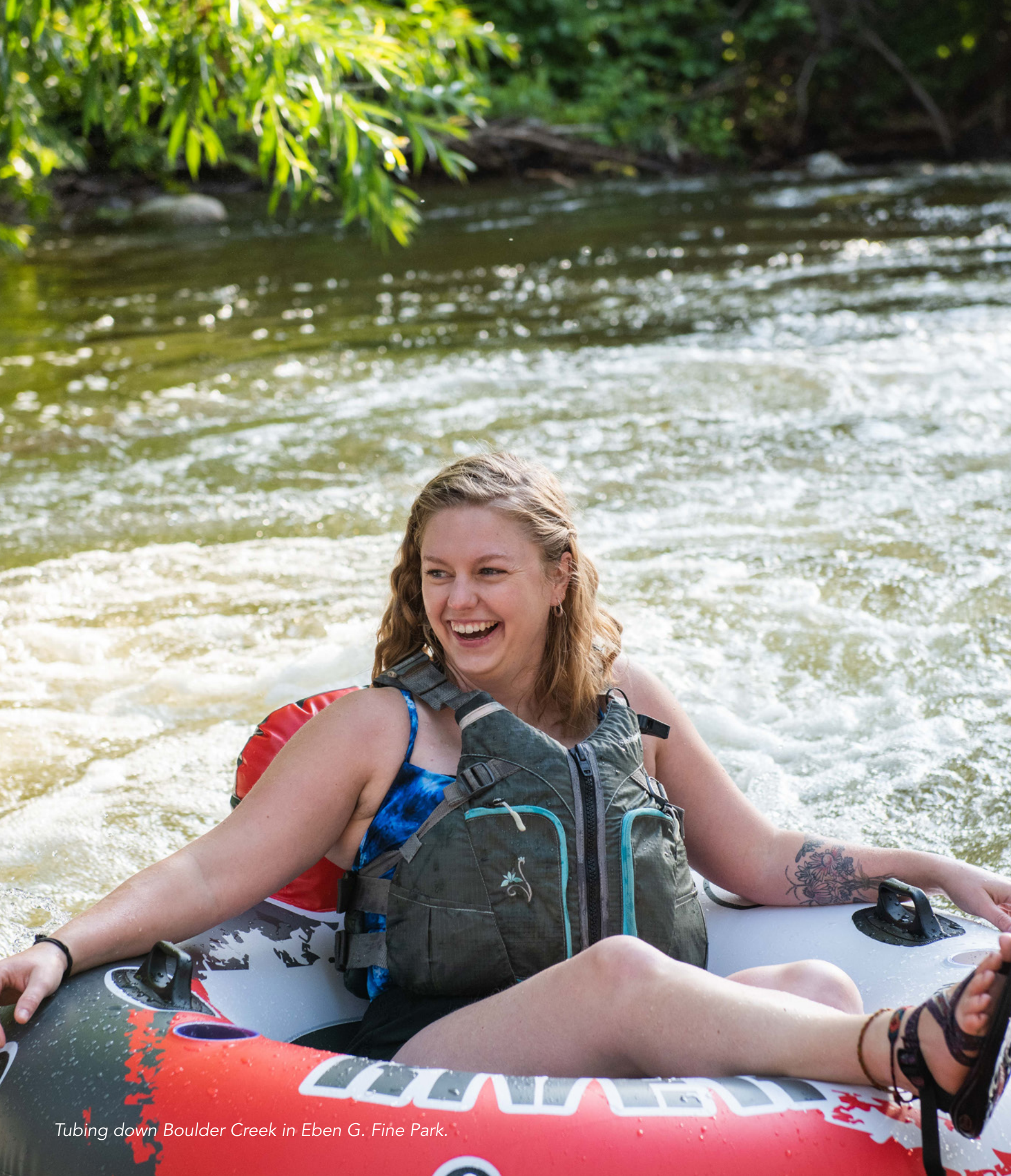
Tubing down Boulder Creek in Eben G. Fine Park.