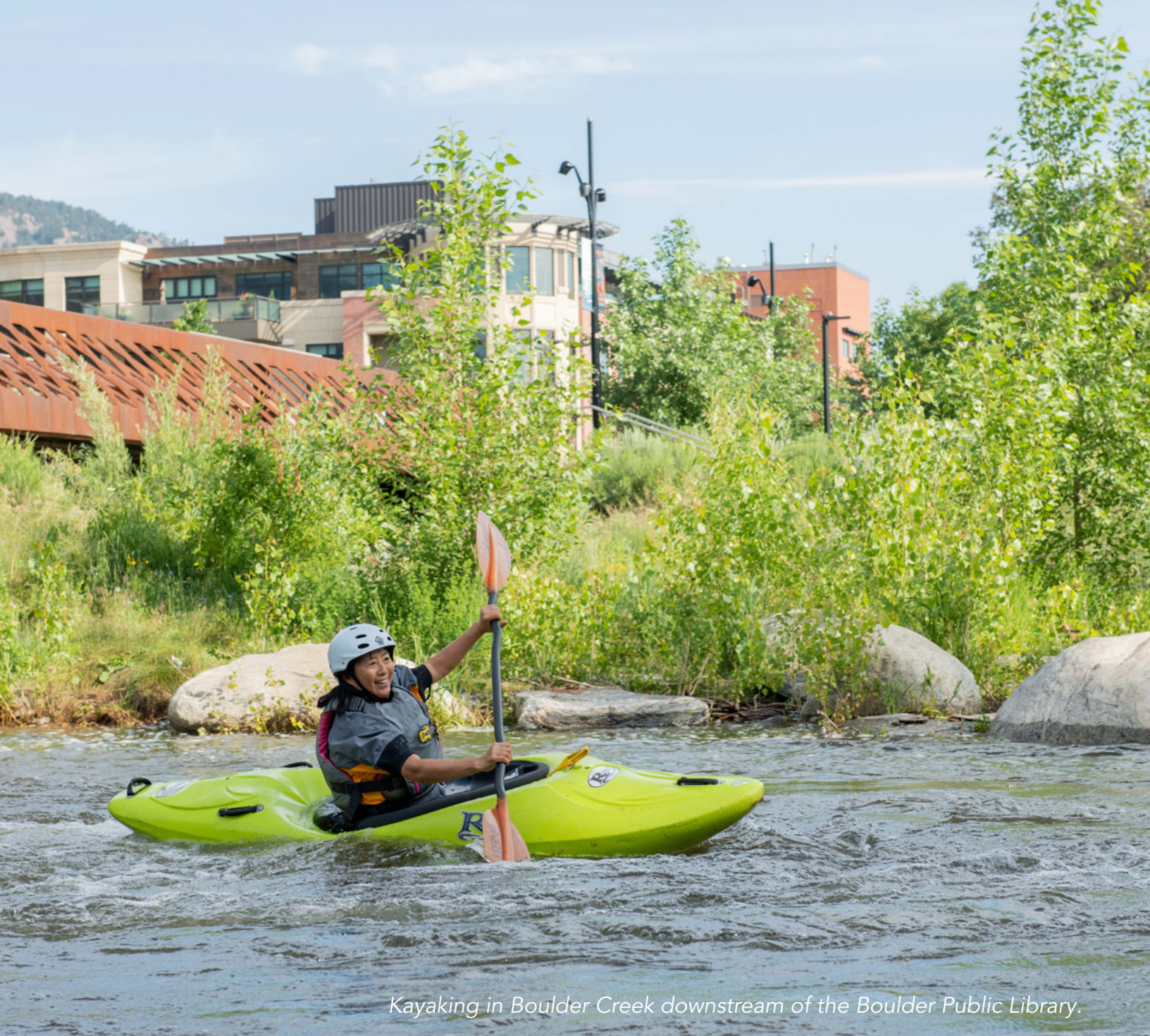
Kayaking in Boulder Creek downstream of the Boulder Public Library.