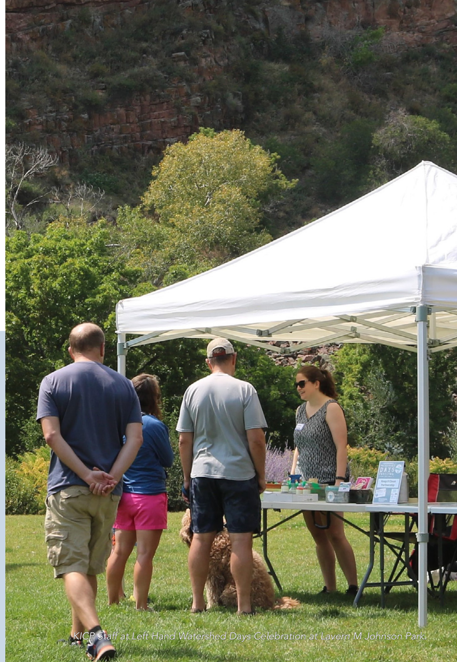
KICP Staff at Left Hand Watershed Days Celebration at Lavern M Johnson Park.