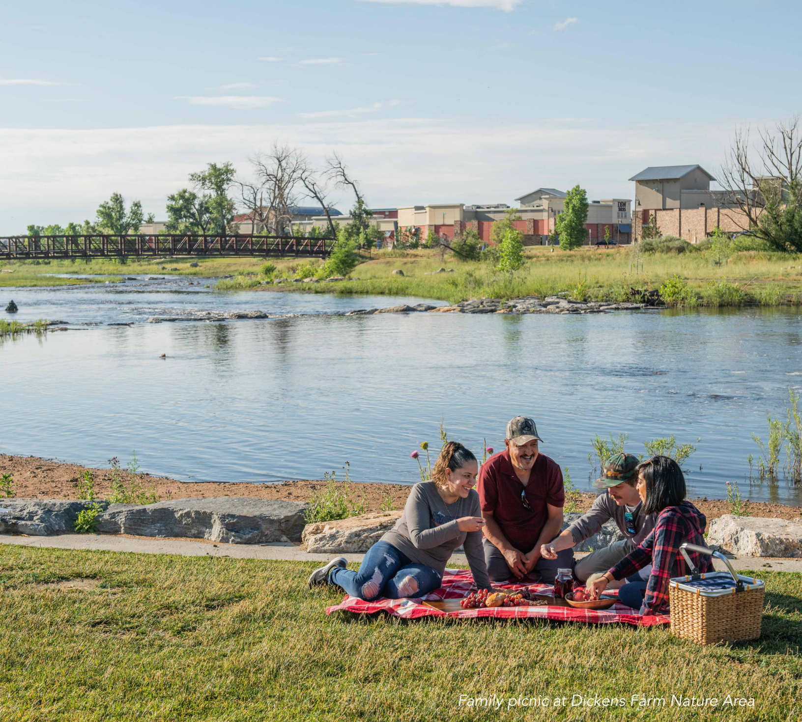
Family picnic at Dickens Farm Nature Area