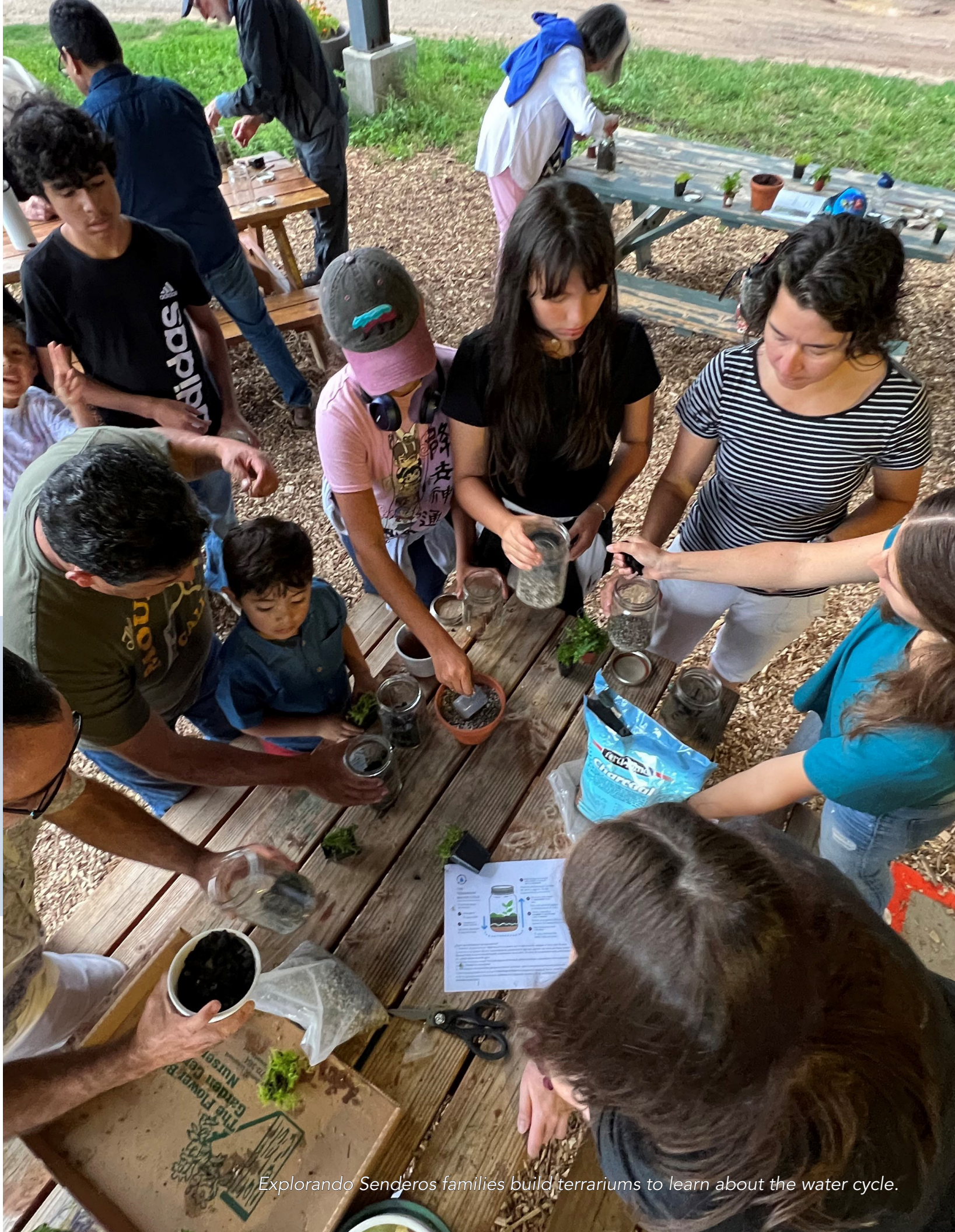
Explorando Senderos families build terrariums to learn about the water cycle.