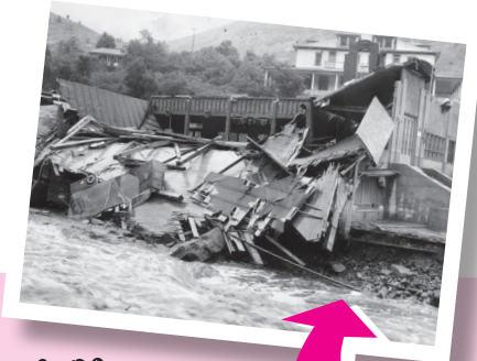
ELDORADO CANYON FLOOD