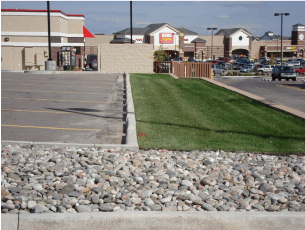
Photograph 4. Grass Buffer Strip, Aurora, Colorado