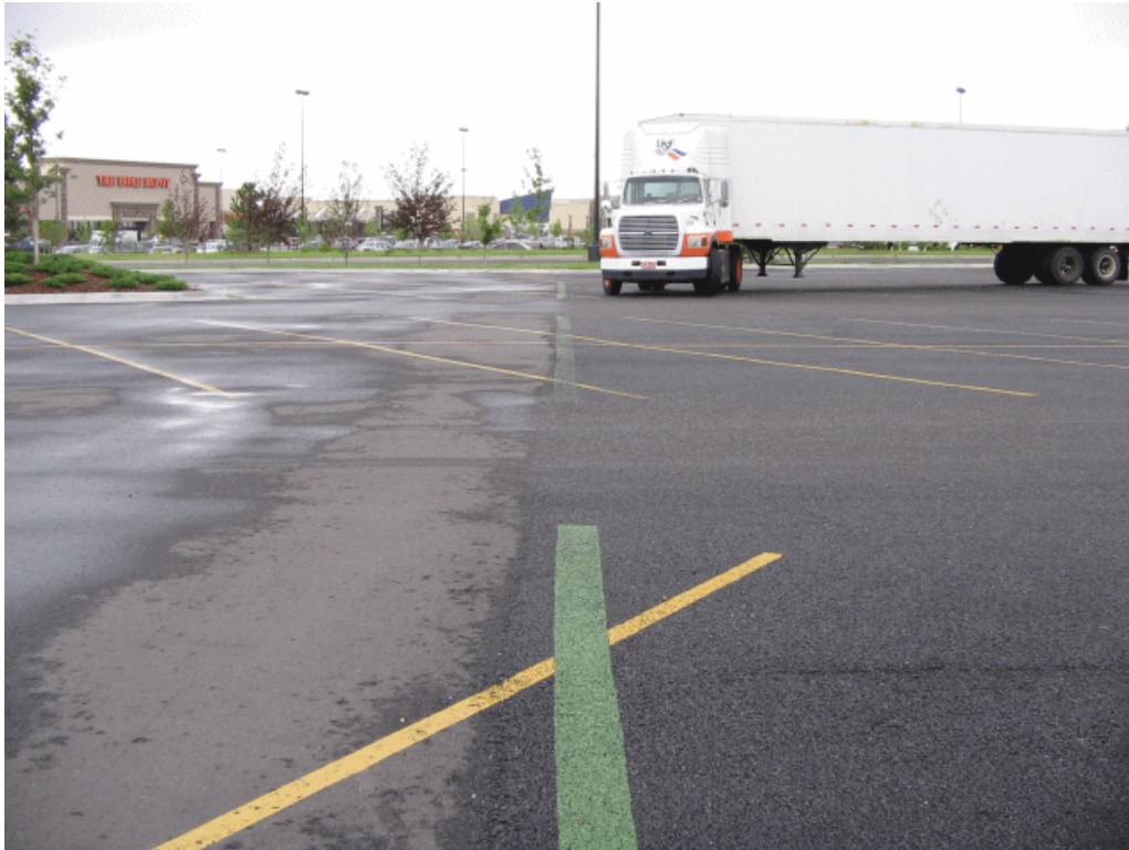
Photograph 6. Pervious Asphalt at Wal-Mart, Tower Road and Interstate 70, Aurora, Colorado