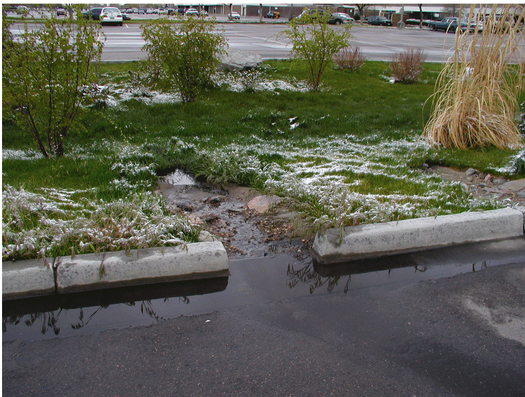
Photograph 2. Bioretention/Porous Landscape Detention, Aurora, Colorado