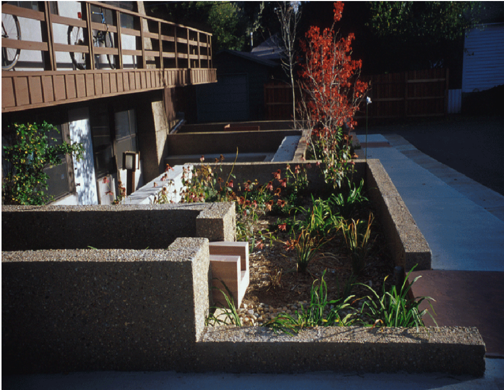
Photograph 1. LID Landscaping for Roof/Building Runoff Boulder, Colorado

http://www.casfm.org/stormwatercommittee/LID-00.htm .