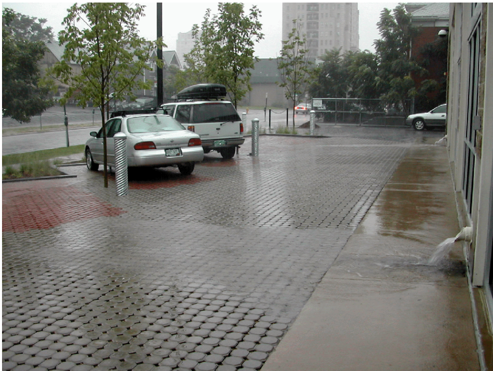
Photograph 5. Parking Areas with Modular Block Pavers, Wenk Associates, Denver Colorado