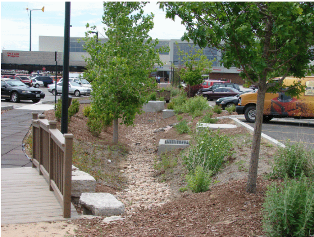
Photograph 3. Bioswale at Wal-Mart, Tower Road and Interstate 70, Aurora, Colorado